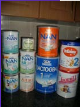
Pre-Nan, Nan 1, Nan 2, Nido, S26, Pelargon, Isomil 1, Isomil 2, Infasoy, Pepticate, AR, LF etc.